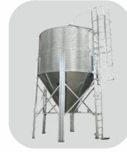
GRAIN STORAGE SILO