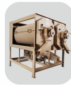
INDENTED CYLINDER ( DOUBLE DRUM )