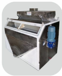
SEED MAGNETIC SEPARATOR