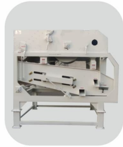
SEED PRE- CLEANERS