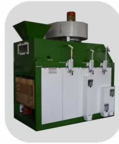
SEED FINE GRADER