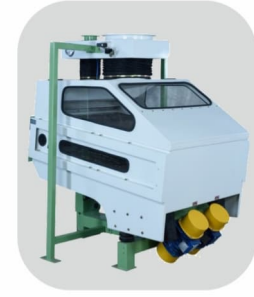
SEED DE - STONER