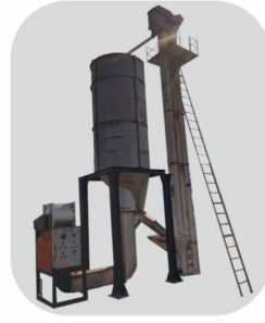
HOT AIR SEED DRYER