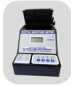
DIGITAL MOISTURE METER