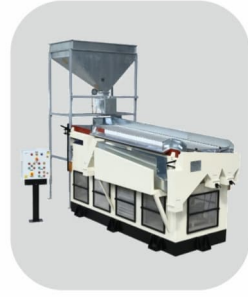
SEED GRAVITY SEPARATOR